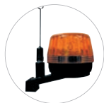
FLA230-2 Flashing light kit

For more accessories please refer to accessory catalog