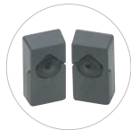
771E Infrared Safety Sensor