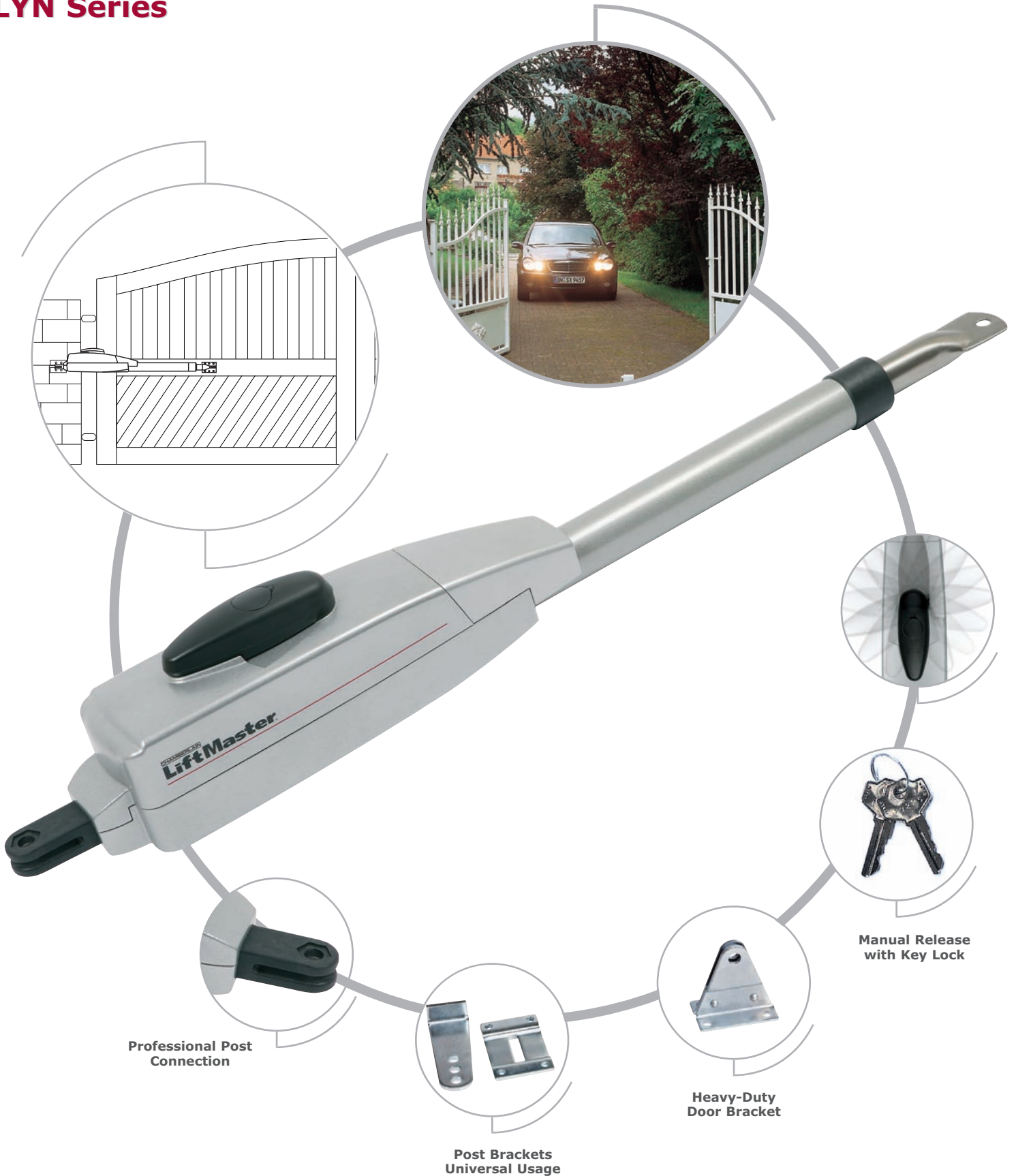
Professional Post Connection